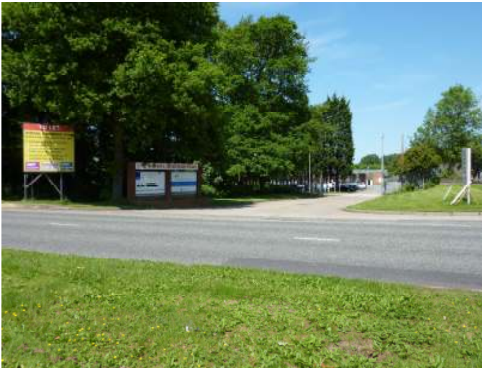
Photo of Business Park Entrance from Arrowe Brook Road

http://www.multimap.com/map/browse.cgi?lat=53.4204&lon=-3.0437&scale=10000&icon=x